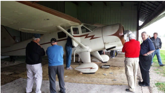
The engine does look good