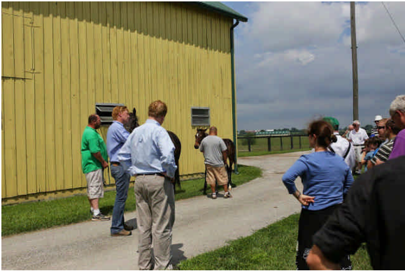
I'm thirsty! Let's go to a distillery