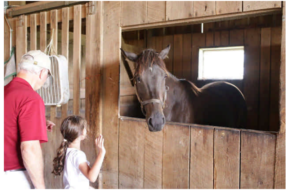
What are YOU staring at?