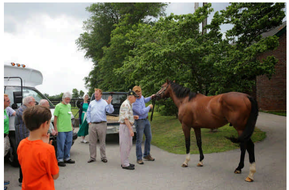
Explaining the finer points of a great horse