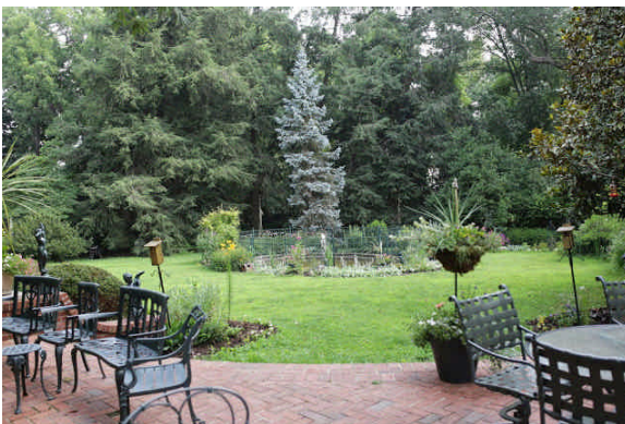
The back yard. Wonderful spot for lunch