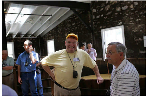
Guys, believe me. It's good!!!