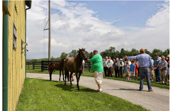
Just look at that thorough bred