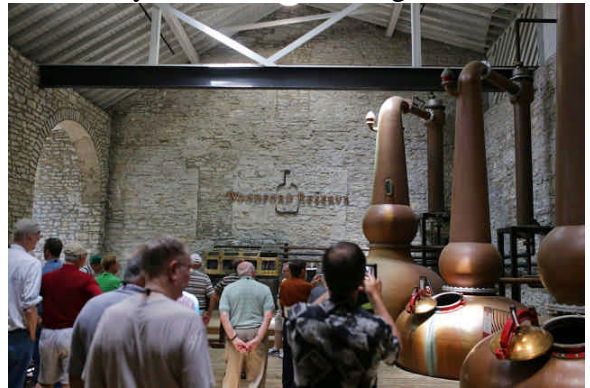
Look at the size of those cookers