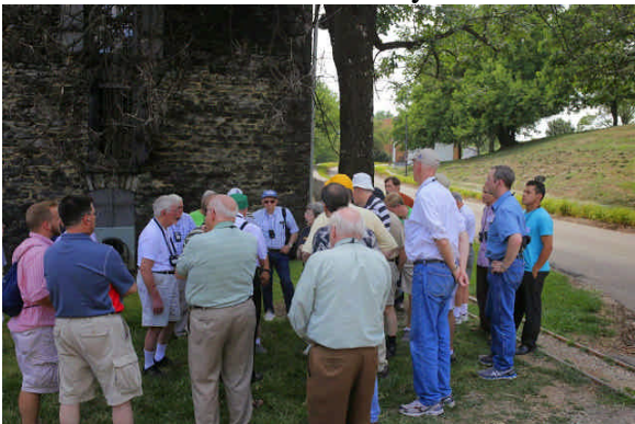
Interesting history of Kentucky bourbon