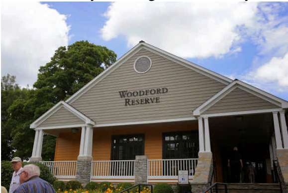
Hey! We found one