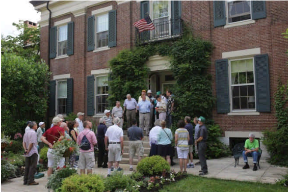
Clay Family Home --Runnymede Horse Farm