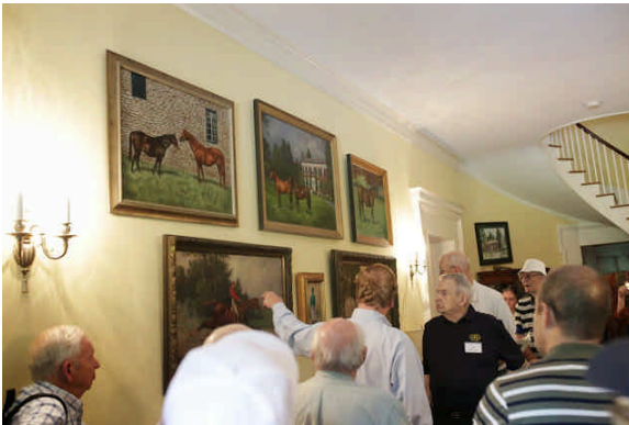
Gallery of Famous Family Horses