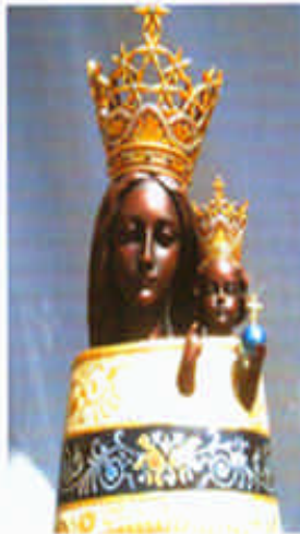
Our Lady of Loreto Patroness of Aviation

We intend to serve, support, and equip the People of God in all segments of the aviation community so that they will be enabled to live out their faith in the public square, achieve their aviation related goals and find fellowship and community with other like-minded people.