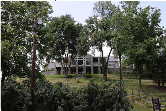
This is a distillery?