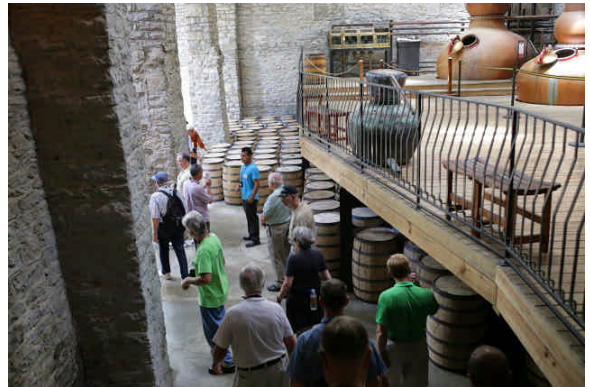
How can we get inside those kegs?