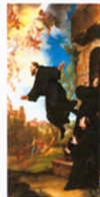
St Joseph of Cupertino Patron of Aviation

Adhere to the teachings of God as supernaturally revealed to the People of God