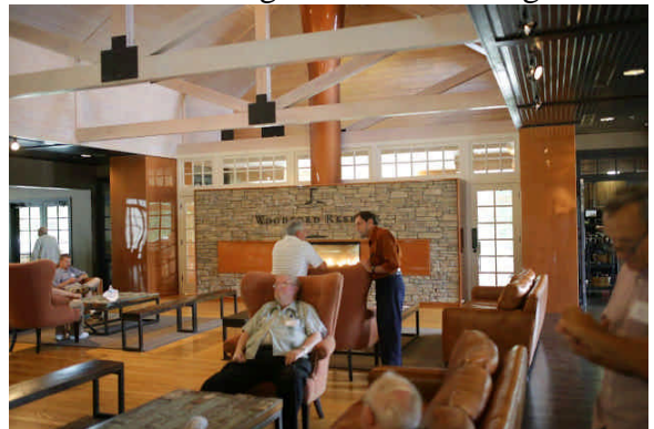
I thought it would never end