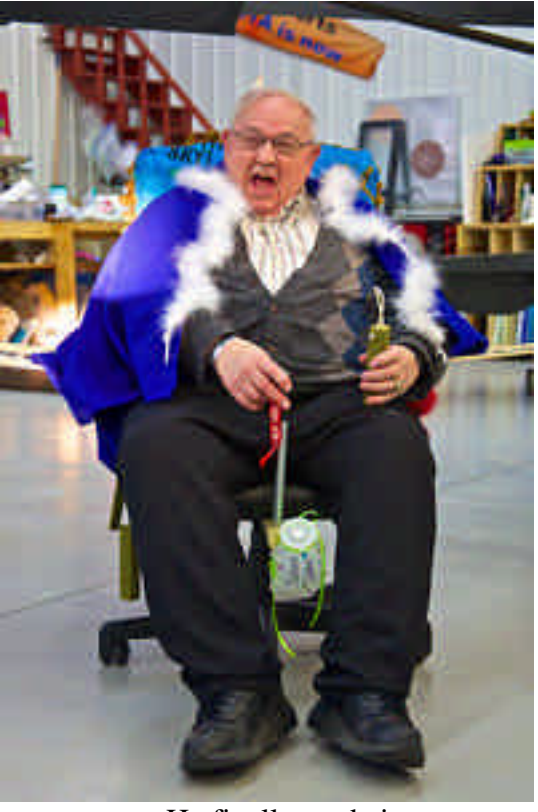
He finally made it