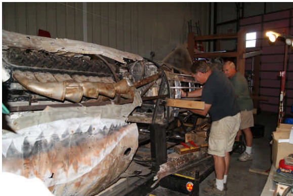
This one needs a little more touching up