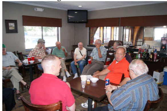
A better world follows this important discussion