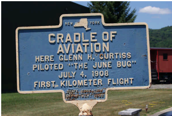
The sign tells it all