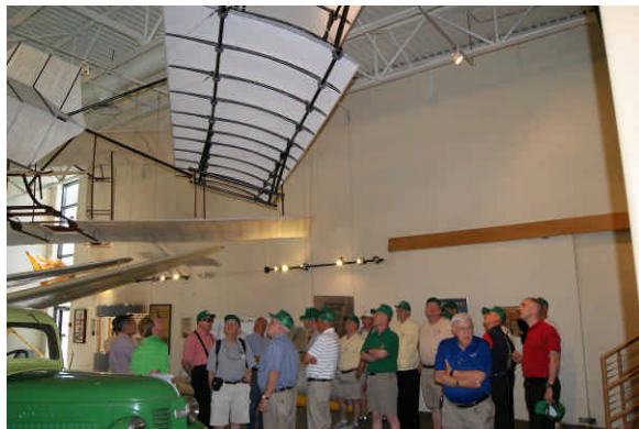
Group under a familiar glider. Wright Flyer