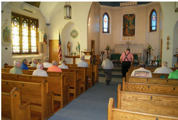
It won't be long. Meantime, say your prayers