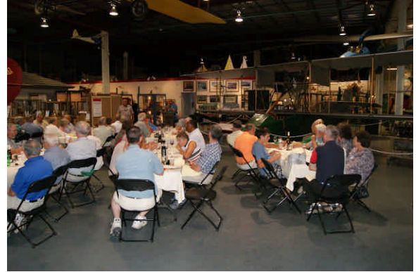
The food will be served shortly