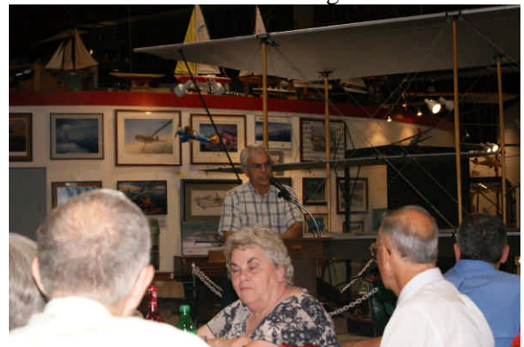
Our speaker enlightens us about Curtiss Wright