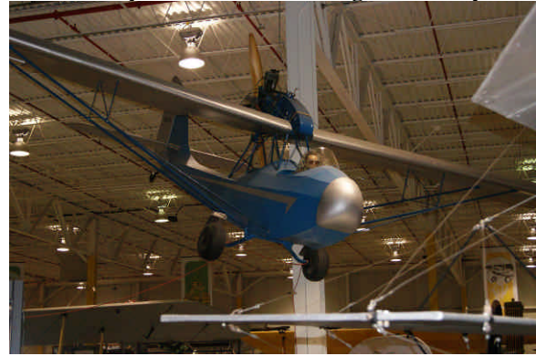
Away she goes