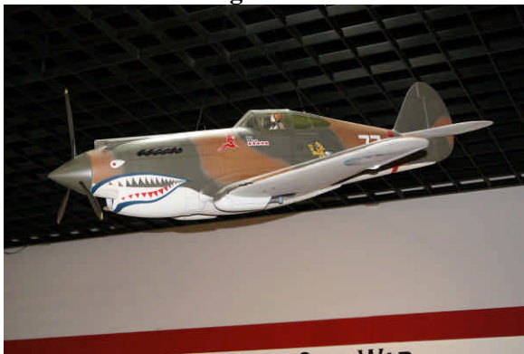
The famous P 40