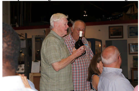
As the oldest NAPP member present he receives the oldest bottle of tainted water