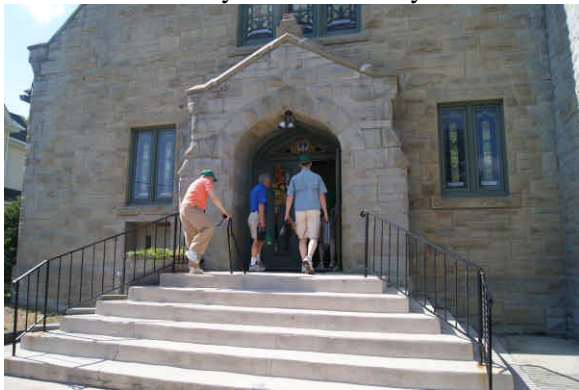
Entrance to St. Gabriel Church – site for Mass