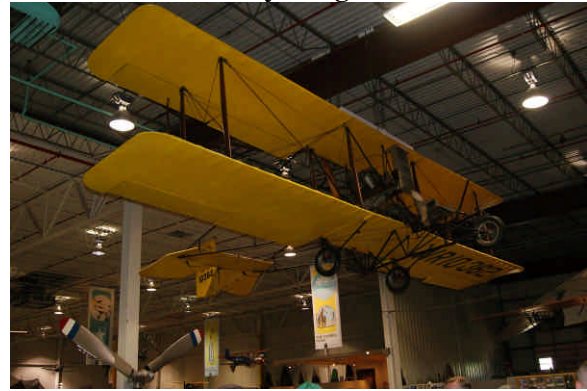
Ideal for a nice cool ride – especially in winter