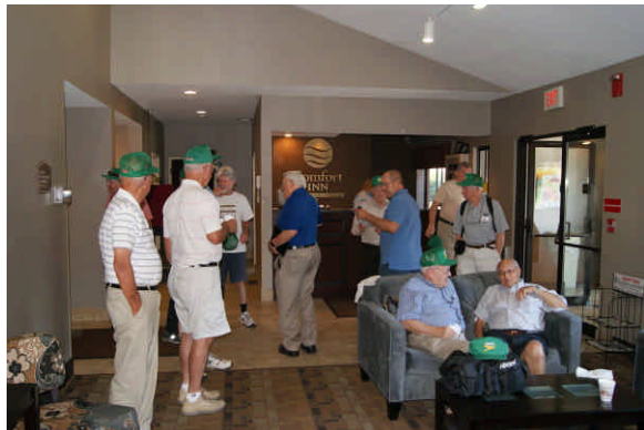
Assembly room for the Museum Tour