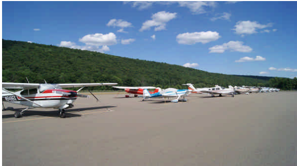
Nine Planes flew in for the convention