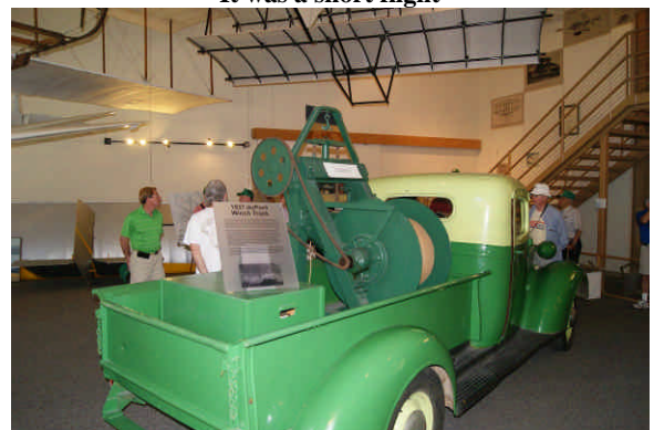
The Pawnee makes a better tow than this winch