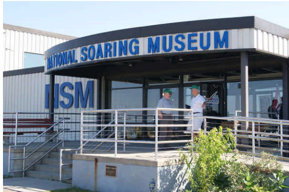
Harris Hill – National Soaring Museum