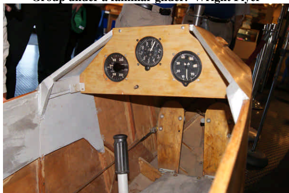
How cluttered can a panel be?