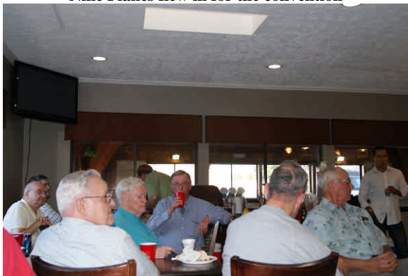
It's Monday night and time to renew friendships