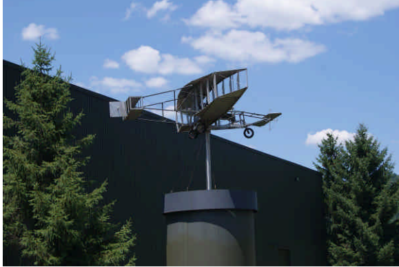
Glenn Curtiss Air Museum