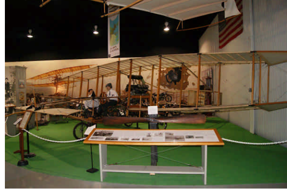
It did fly at one time – in the good old days