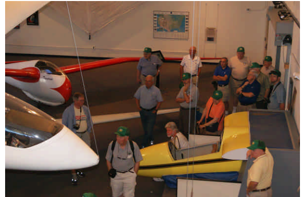
Gliders all over the place – floor to ceiling