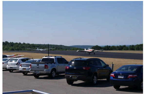
Who is the NAPP member going aloft in the glider