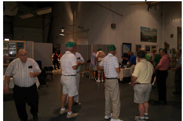
Drinks are now being served