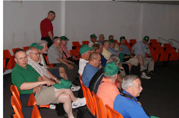
2012 NAPP Annual Meeting about to begin