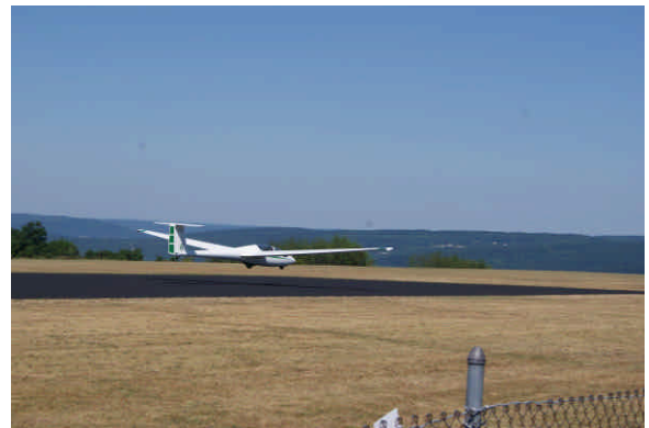
It was a short flight