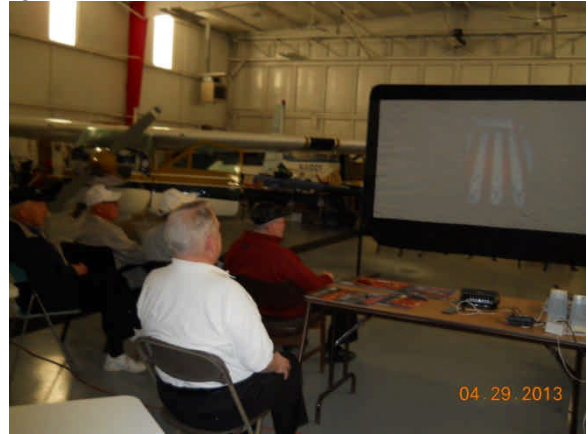
It is interesting

United States Marine Corps AV-8B11 Harrier Tac Demo, United States Air Force F-15 Eagle Tac Demo, United States Air Force A-10 Warthog Tac Demo, United States Air Force F-16 Viper Tac Demo, United States Navy F/A-18C Hornet Tac Demo, United States Air Force F-15E Strike Eagle Tac Demo, United States Navy F/A-18F Super Hornet Tac Demo, United States Air Force F-117A Blacknight Tac Demo, Canadian CF-188 Hornet Demo at almost every single show.