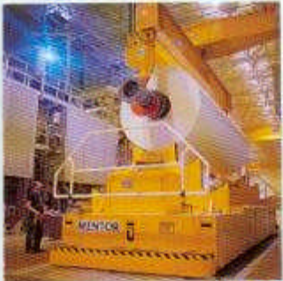
No. 16 paper machine complex