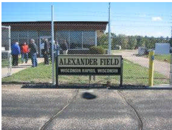
NAPP Members from Iowa, Kansas, Missouri, and Wisconsin