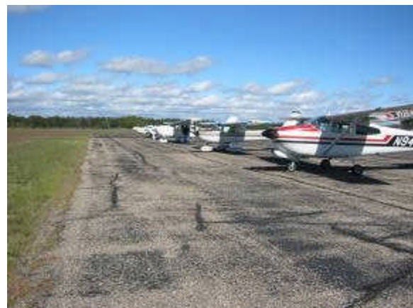
NAPP Planes at Alexander Field