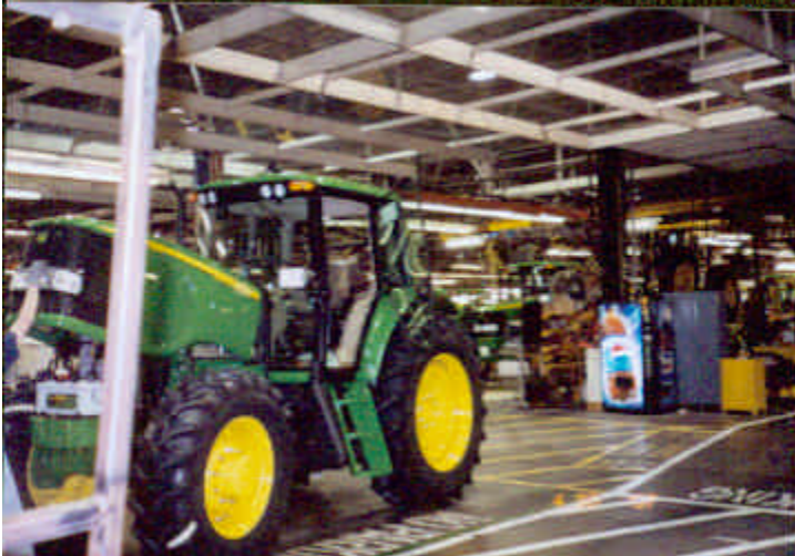
One of the new models getting the finishing touches