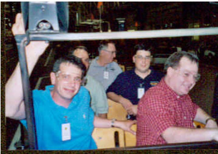
This sure beats a walking tour in a BIG factory