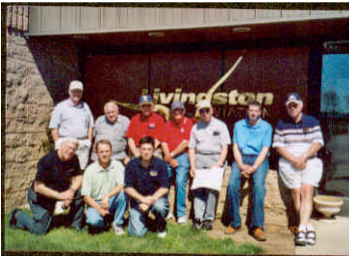
One final shot at the FBO before departing