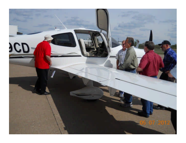
A look at host Ted's Cirrus

2 UltraLight fuselages ready for shipment