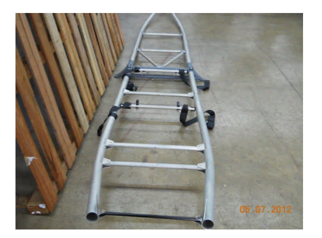
Bottom of UltraLight fuselage