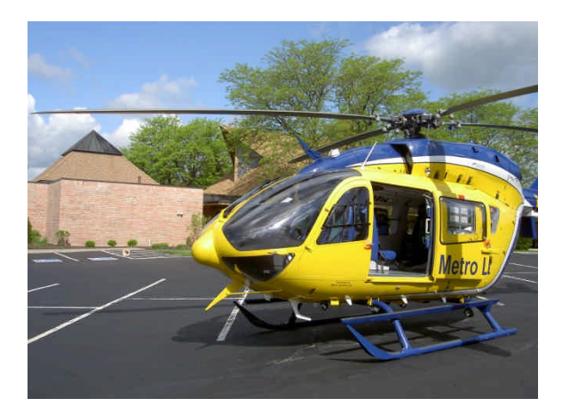
vision goggles to assist with navigation for evening flights.

The Metro Life Flight fleet of EC-145 aircraft provides advanced aviation safety features, such as terrain warning system, real-time satellite weather and weather radar, allowing greater flexibility in dealing with potentially changing weather conditions. Further, pilots utilize night