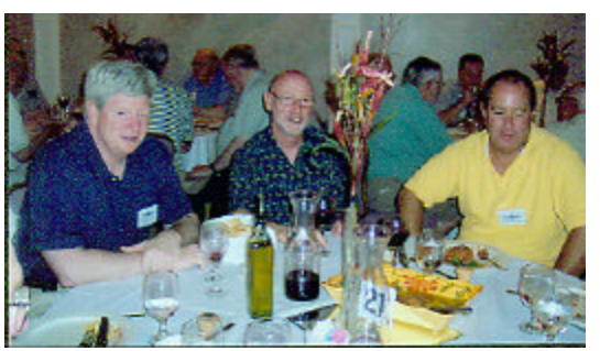
After all that space time we're hungry