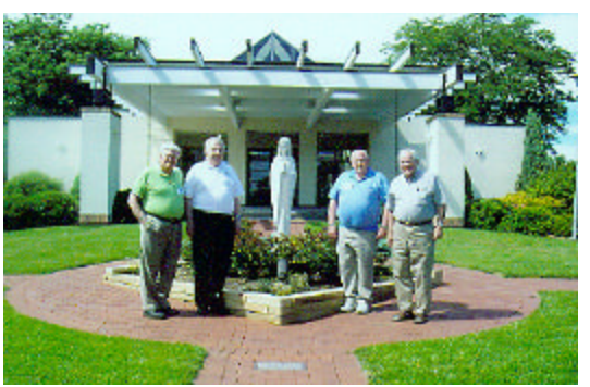
St. Victor Church, Richfield, OH