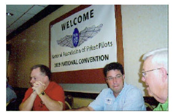
2009 National Meeting