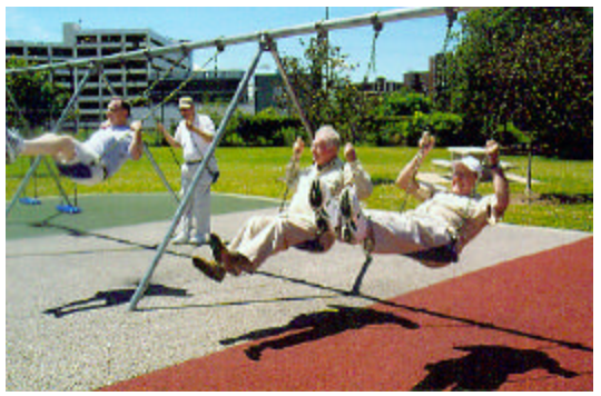
There's more than one way to fly