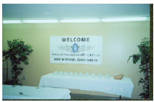
Our hosts did a great job