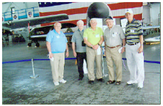
Visitors at Air Force Museum