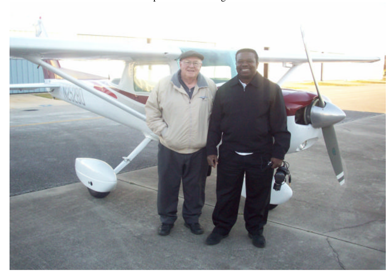
(The picture above of Login and myself was taken last winter at Florida's Daytona Beach airport)