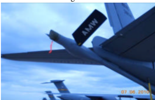
The gas nozzle on a KC 135