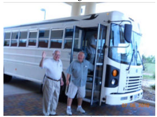
Boarding the bus for the AFB