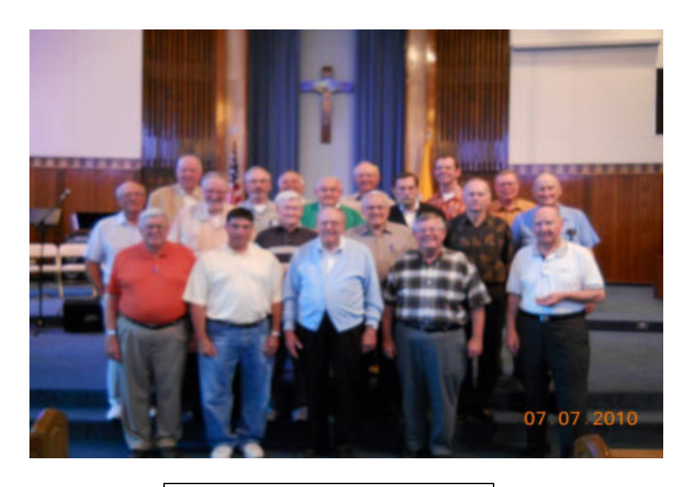
NAPP Group After Mass