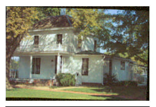
EISENHOWER HOME TILL MOTHER'S DEATH IN 1946