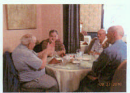
Noon Lunch - Kirby Center