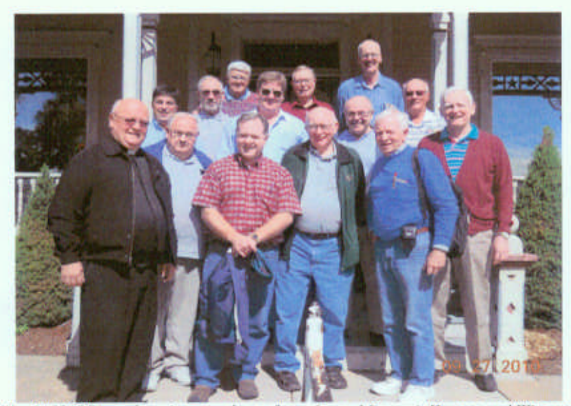
The 14 NAPP members in attendance from Iowa, Missouri, Kansas and Wisconsin