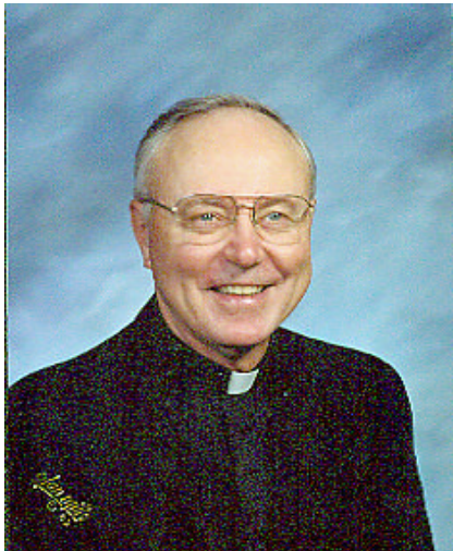
THE PRESIDENT'S MESSAGE