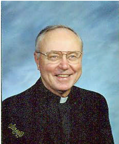
THE PRESIDENT'S MESSAGE

It is good to be back in Iowa from Texas and to see the sun shine and calm winds. The flying season is upon us. Rumor has it that there is an NAPPER in Jefferson, South Dakota with a new 1946 Cessna 140. I am glad to hear that he bought a "real airplane". A real airplane is one with the tail wheel on the tail and not hanging down in the front. Of course if a tail wheel pilot is