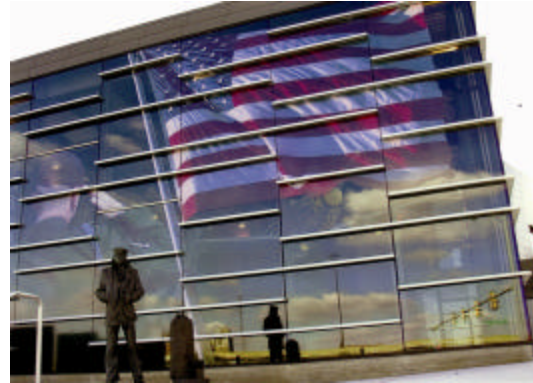
Five Sullivans Memorial Museum