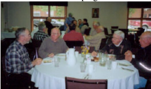
The end is in sight