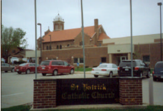
St Patrick Church gathering site

The primary focus of the Museum tour centered around the Waterloo 5 Sullivan brothers killed in WW II when their ship went down in the Pacific.