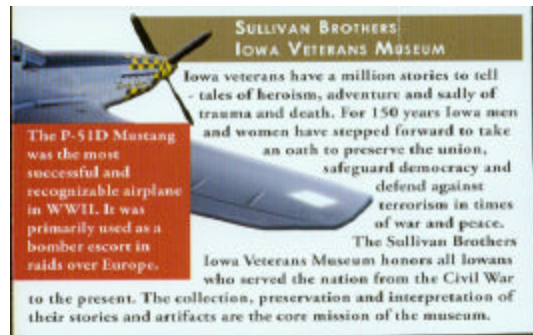
P-51D Museum display