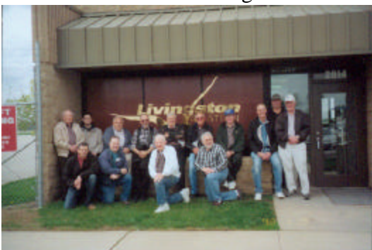
14 of the 16 made the picture