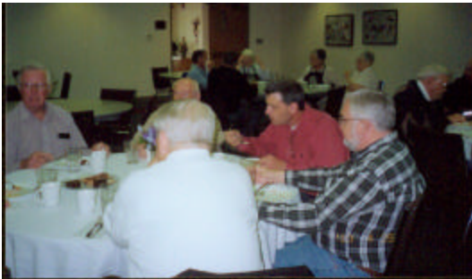
A lunch in progress