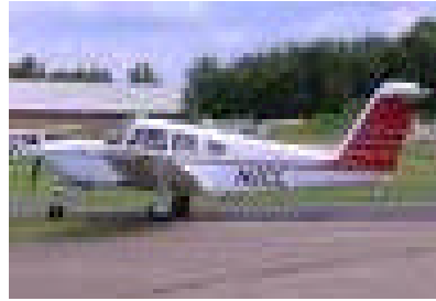
N2CL at Rochester, UK

As you may remember me telling you, by having an ‘N’ plane, and with three of us in the group who have FAA IR's we can fly her IFR in Europe. I have just come back from a 17 hour trip to Corsica & Sardinia in the Mediterranean which – due to the weather – we could not have done without the IR.