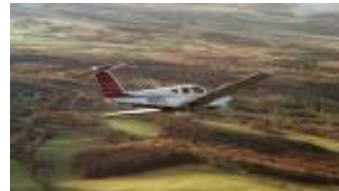
N2CL in flight

As you may remember me telling you, by having an ‘N’ plane, and with three of us in the group who have FAA IR's we can fly her IFR in Europe. I have just come back from a 17 hour trip to Corsica & Sardinia in the Mediterranean which – due to the weather – we could not have done without the IR.