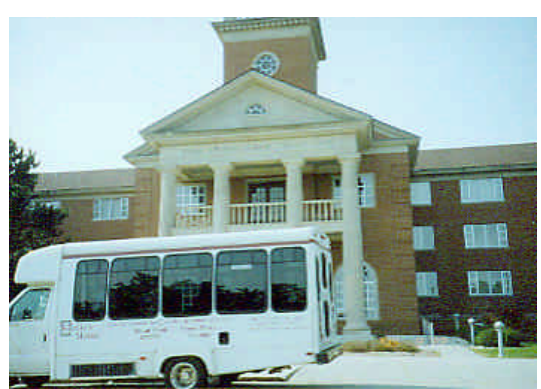
Catholic Pastoral Center, Madison