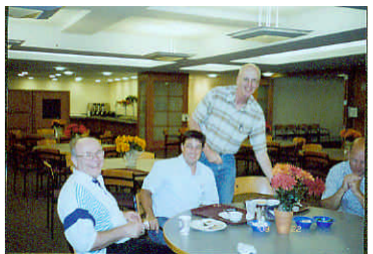
Lunch at the Pastoral Center