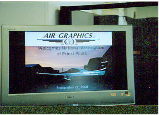
Example of designs made for the Cirrus