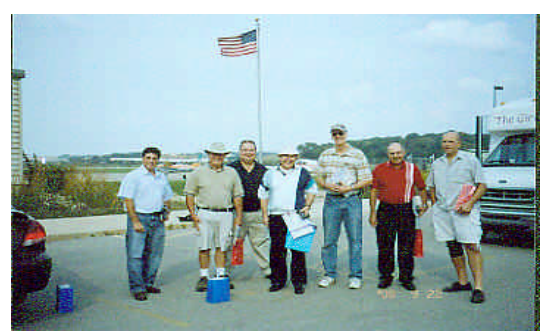
The group at the Airport in Middleton