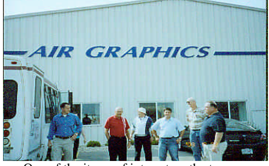
One of the items of interest on the tour