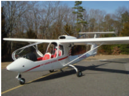
Sky Arrow 600 Sport

Msgr Joe Dooley sends the following From Bethlehem, PA