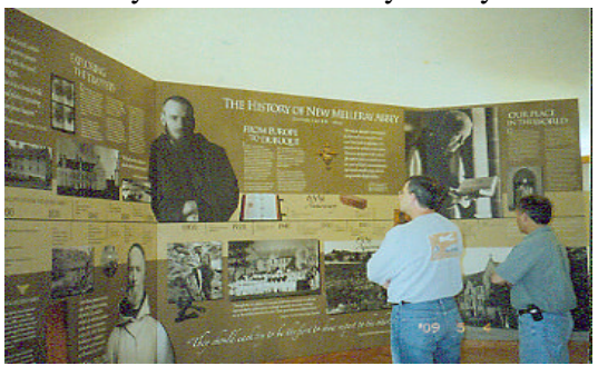
No wines, candies or jelly here