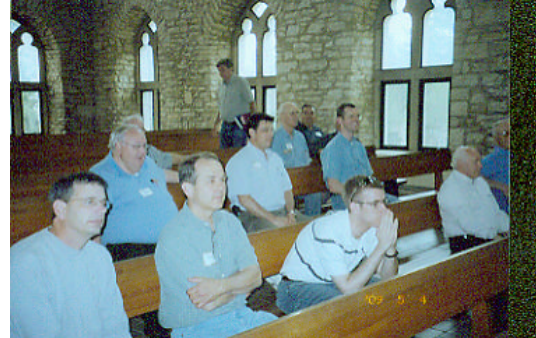
Prayer at New Melleray Abbey