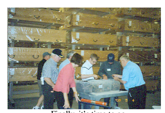
Finally, it's time to go