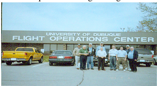
The UD Flight Op Center - above & below