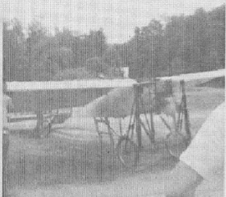
One of Cole Palen's birds