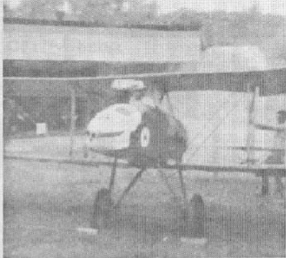
Haacke, you'll never get off...