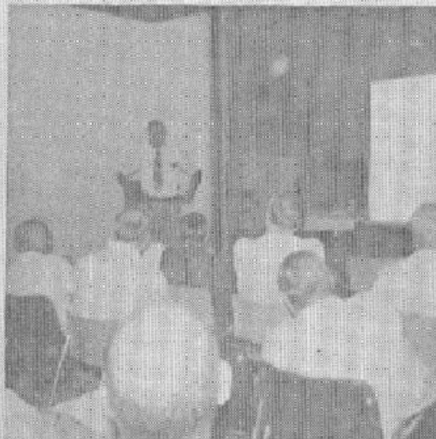
Flying in Honduras