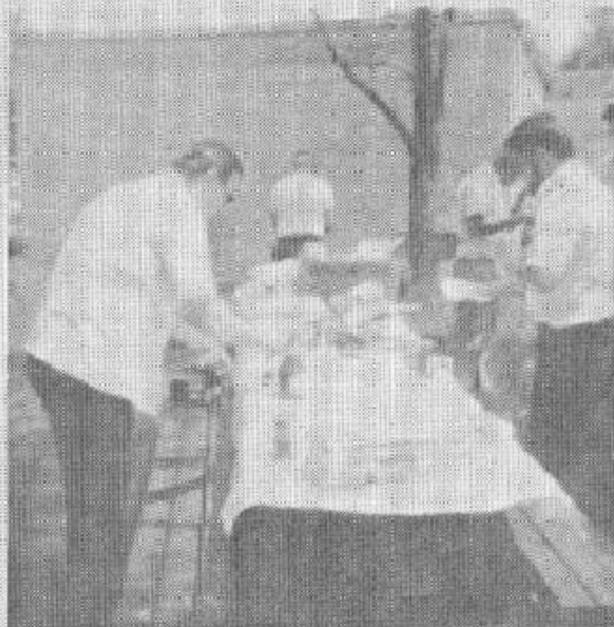
After a long flight - yum!!