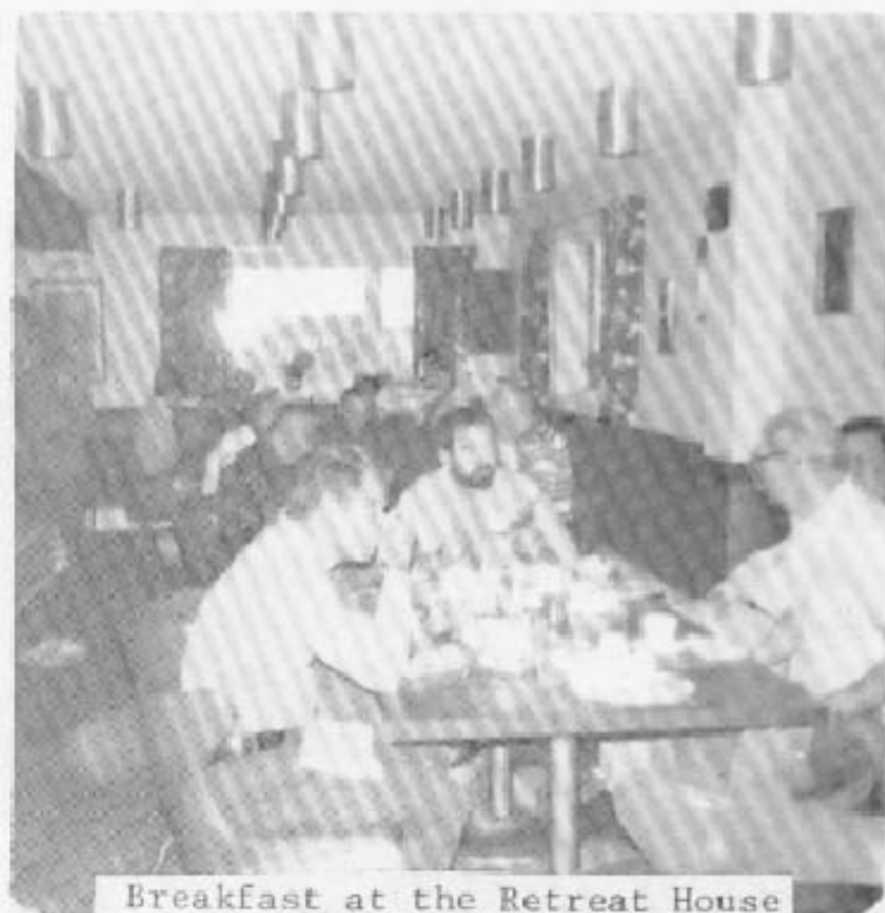
Breakfast at the Retreat House