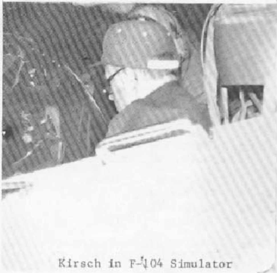
Kirsch in F-104 Simulator