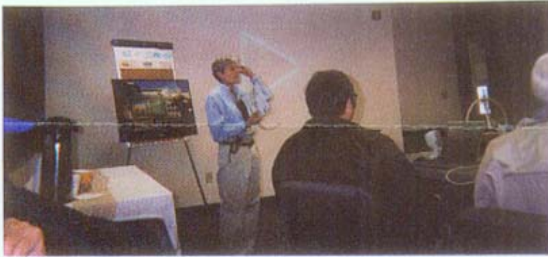
Info session prior to plant tour