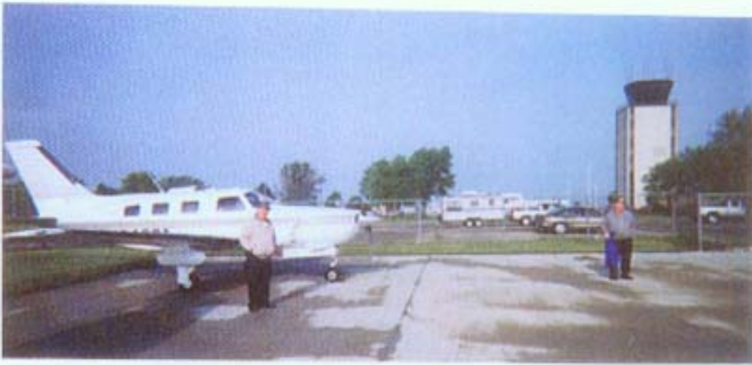
Mel & Malibu prior to leaving Waterloo