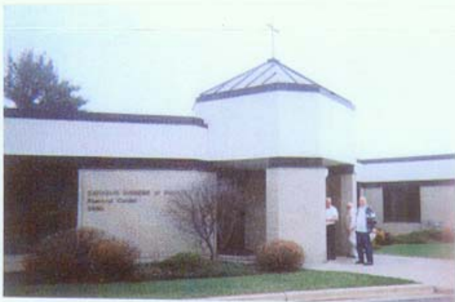
Duluth Diocesan Catholic Center