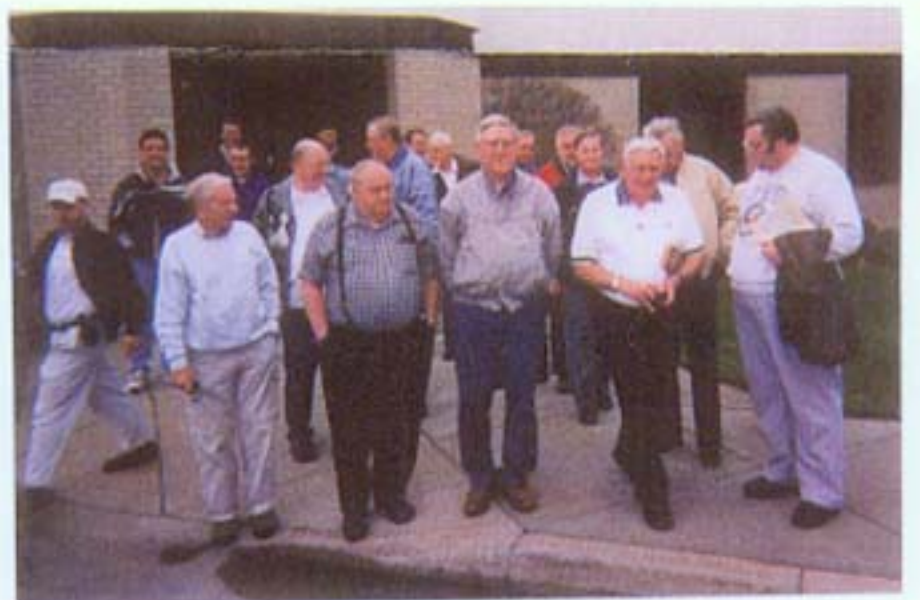
The 21 members departing Catholic Center

21 members and guests from Illinois, Iowa, Minnesota, Michigan, West Virginia and Wisconsin in attendance. Because of security no pictures were allowed in the Cirrus plant