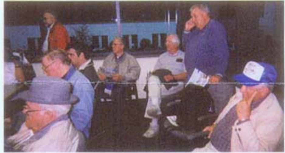
Attentive NAPP members taking it in