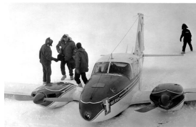
Aztec at the pole