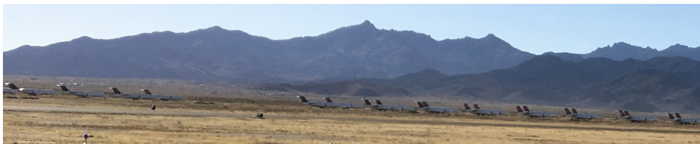
Airliners in the "boneyard" at the airport in Kingman, Arizona.

I'm looking forward to February to discover more of the desert's secrets.