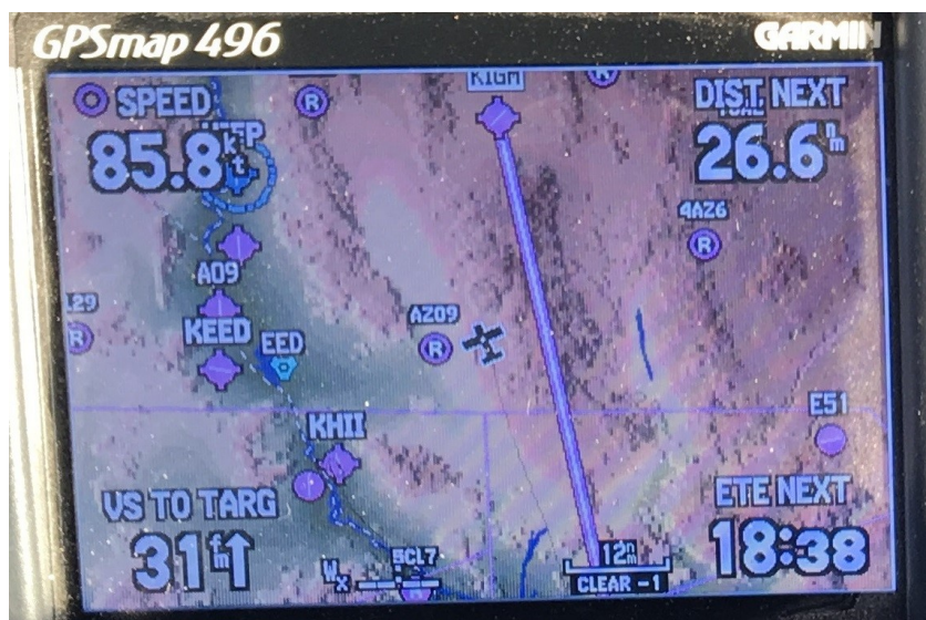
On the way to Kingman, Arizona, (IGM), with an air speed of 100 knots and ground speed of 85.8.

On January 24, we flew up to Kingman, 100 miles at 340 degrees, where they have a "boneyard" for old airliners that have used up all their useful life. There were probably 100 on the field waiting to be chopped up. It is kind of a sad sight.