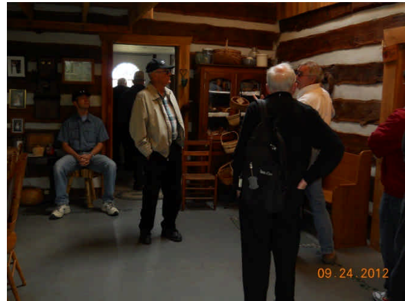
There's no place like a log cabin for a carver and his toys A log cabin is the ideal environment for a wood carver