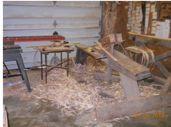
To weave a basket of wood requires a lot of preparation to slim things down to a manageable level. (See a finished basket with Joe on the chair at left).