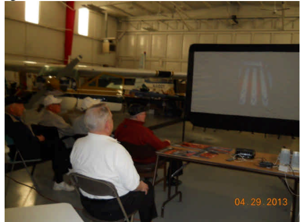
It is interesting

United States Marine Corps AV-8B11 Harrier Tac Demo, United States Air Force F-15 Eagle Tac Demo, United States Air Force A-10 Warthog Tac Demo, United States Air Force F-16 Viper Tac Demo, United States Navy F/A-18C Hornet Tac Demo, United States Air Force F-15E Strike Eagle Tac Demo, United States Navy F/A-18F Super Hornet Tac Demo, United States Air Force F-117A Blacknight Tac Demo, Canadian CF-188 Hornet Demo at almost every single show.