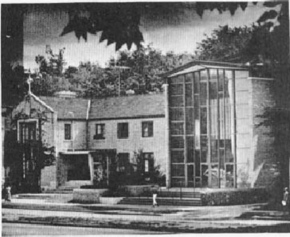
St. Thomas Aquinas Church