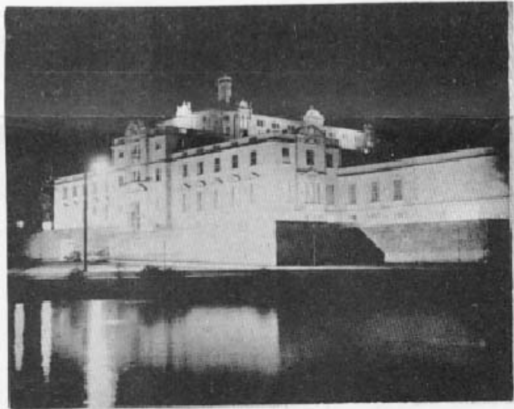
Iowa State University Memorial Union