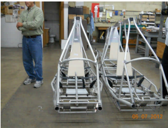
2 UltraLight fuselages ready for shipment