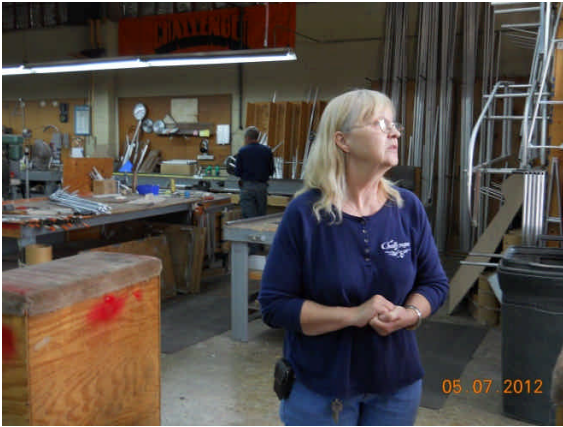
Hostess and General Manager of UltraLight