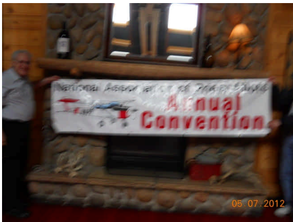
It really was an official NAPP gathering