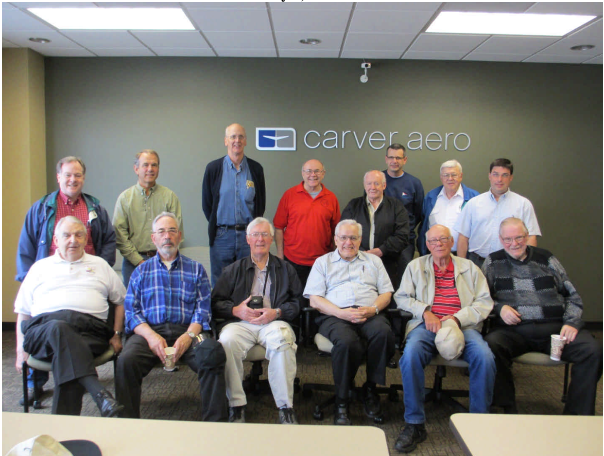
Fourteen Midwest NAPP members from Iowa, Illinois, Kansas, Missouri and Wisconsin gathered at FBO Carver Aero, Davenport, Iowa on May 7, 2012.