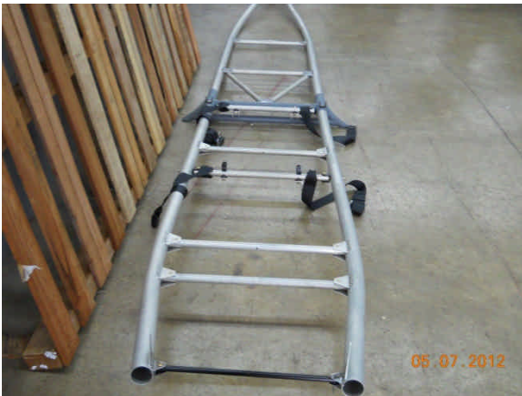
Bottom of UltraLight fuselage