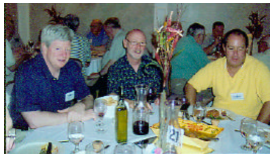
After all that space time we're hungry