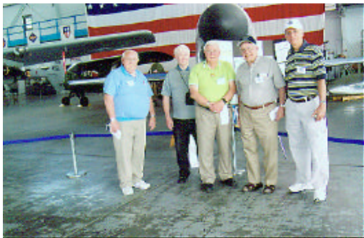
Visitors at Air Force Museum