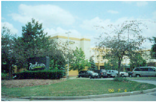
The Radisson – our headquarters