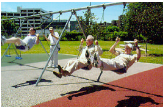
There's more than one way to fly