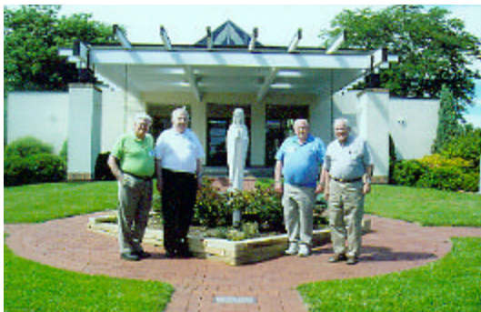
St. Victor Church, Richfield, OH