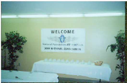
Our hosts did a great job