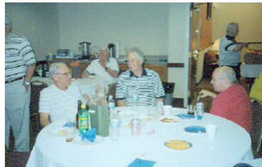
It sure was a good meal