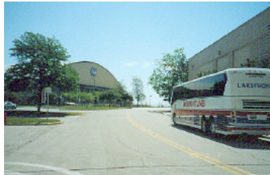
John Glenn NASA experimental site