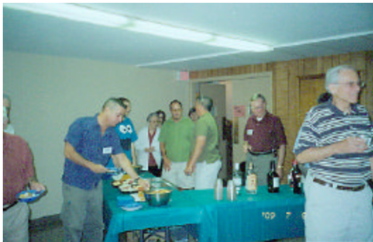
After a long trip this is good