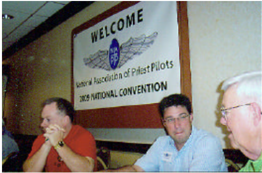
2009 National Meeting