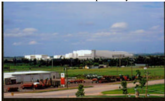
ALTUS AFB Hangars from the motel