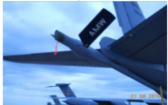
The gas nozzle on a KC 135