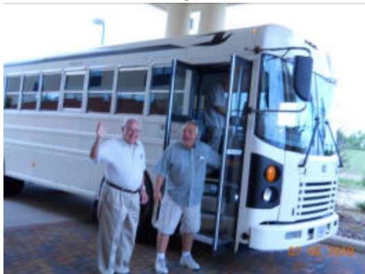
Boarding the bus for the AFB