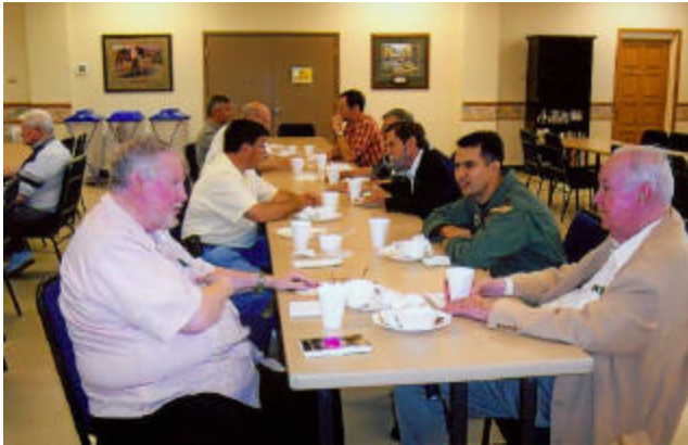
There's Always Good Food