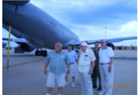
Checking out a C 17