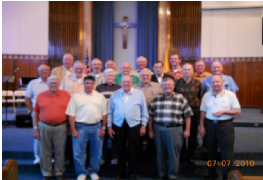
NAPP Group After Mass