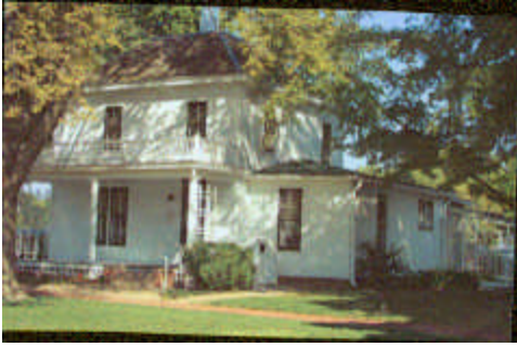
EISENHOWER HOME TILL MOTHER'S DEATH IN 1946