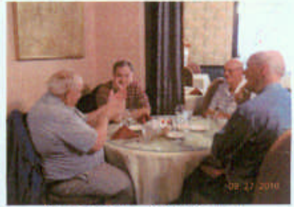
Noon Lunch – Kirby Center