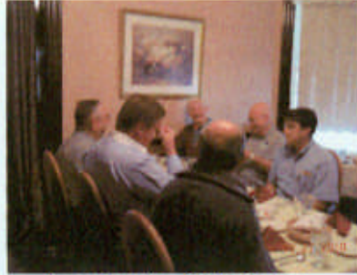
Noon Lunch – Kirby Center