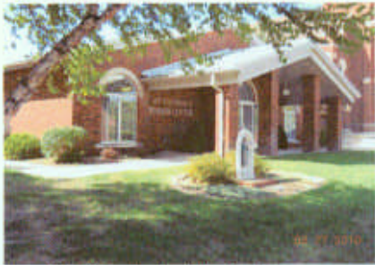
St. Mary's Parish Center