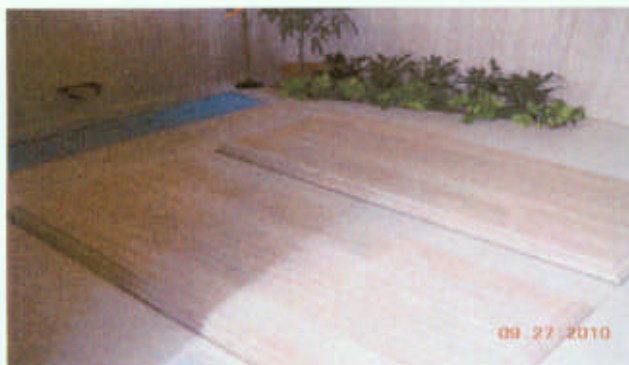
Ike and Mamie's tomb