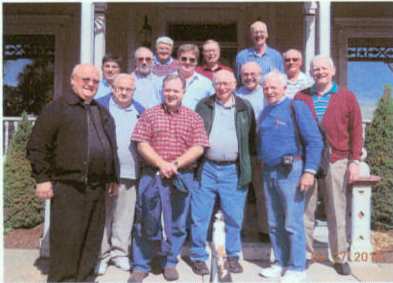
The 14 NAPP members in attendance from Iowa, Missouri, Kansas and Wisconsin