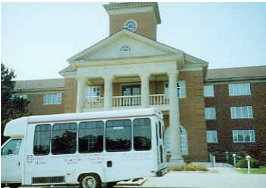
Catholic Pastoral Center, Madison