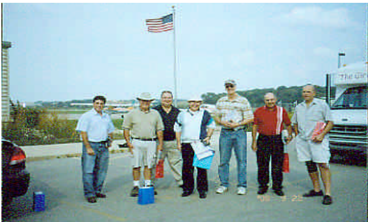
The group at the Airport in Middleton