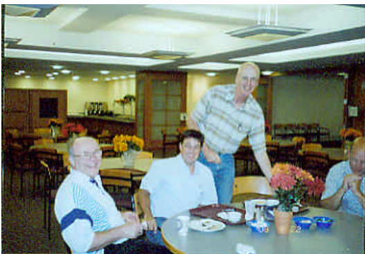
Lunch at the Pastoral Center