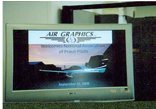
Example of designs made for the Cirrus