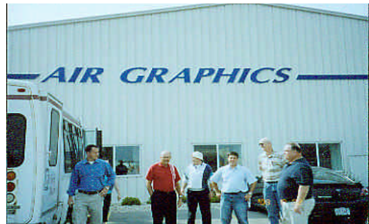
One of the items of interest on the tour