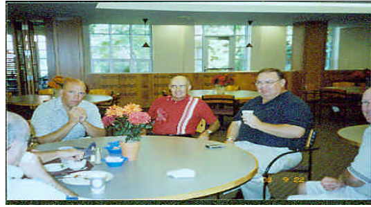
They're still at it