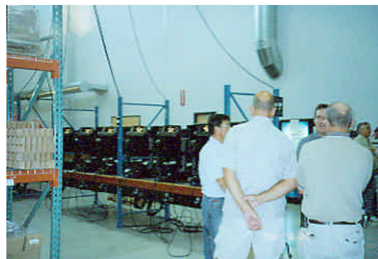
Electronic Theatre Controls