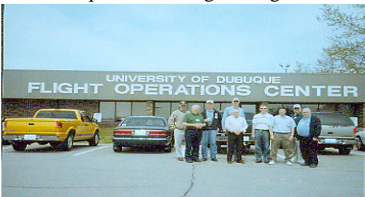
The UD Flight Op Center - above & below