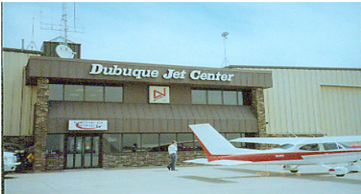
Dubuque Jet Center gathering site