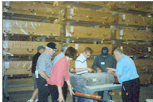
Finally, it's time to go