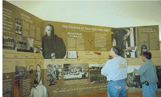
No wines, candies or jelly here