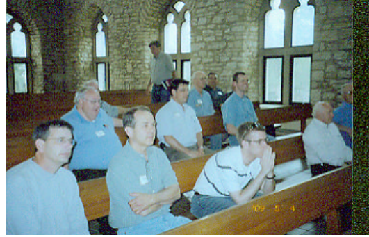
Prayer at New Melleray Abbey