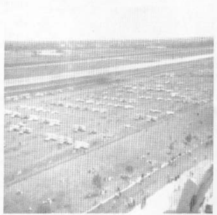
Oshkosh from the chopper