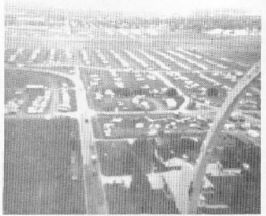
Oshkosh from the chopper