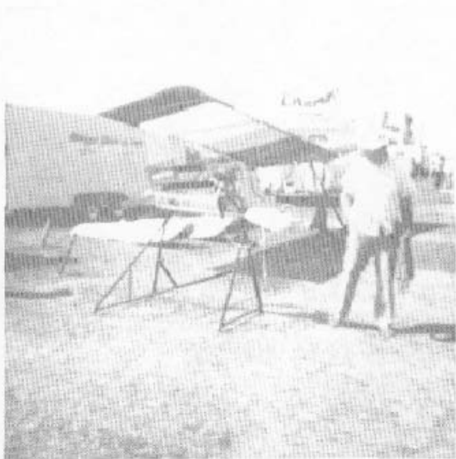
Will that kite fly???