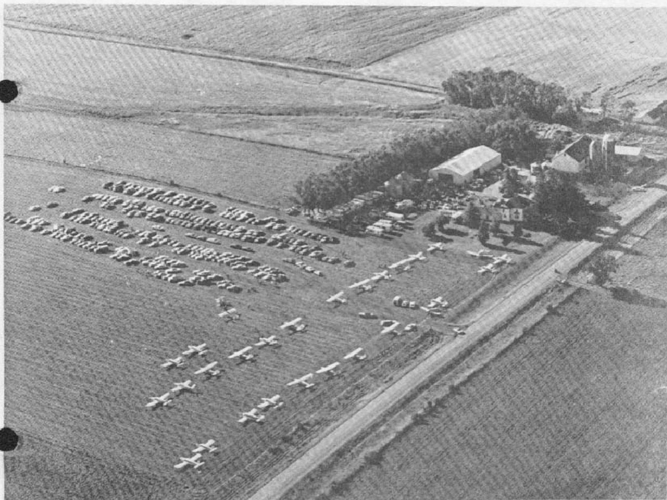
AERIAL VIEW AT HEMANN FARM