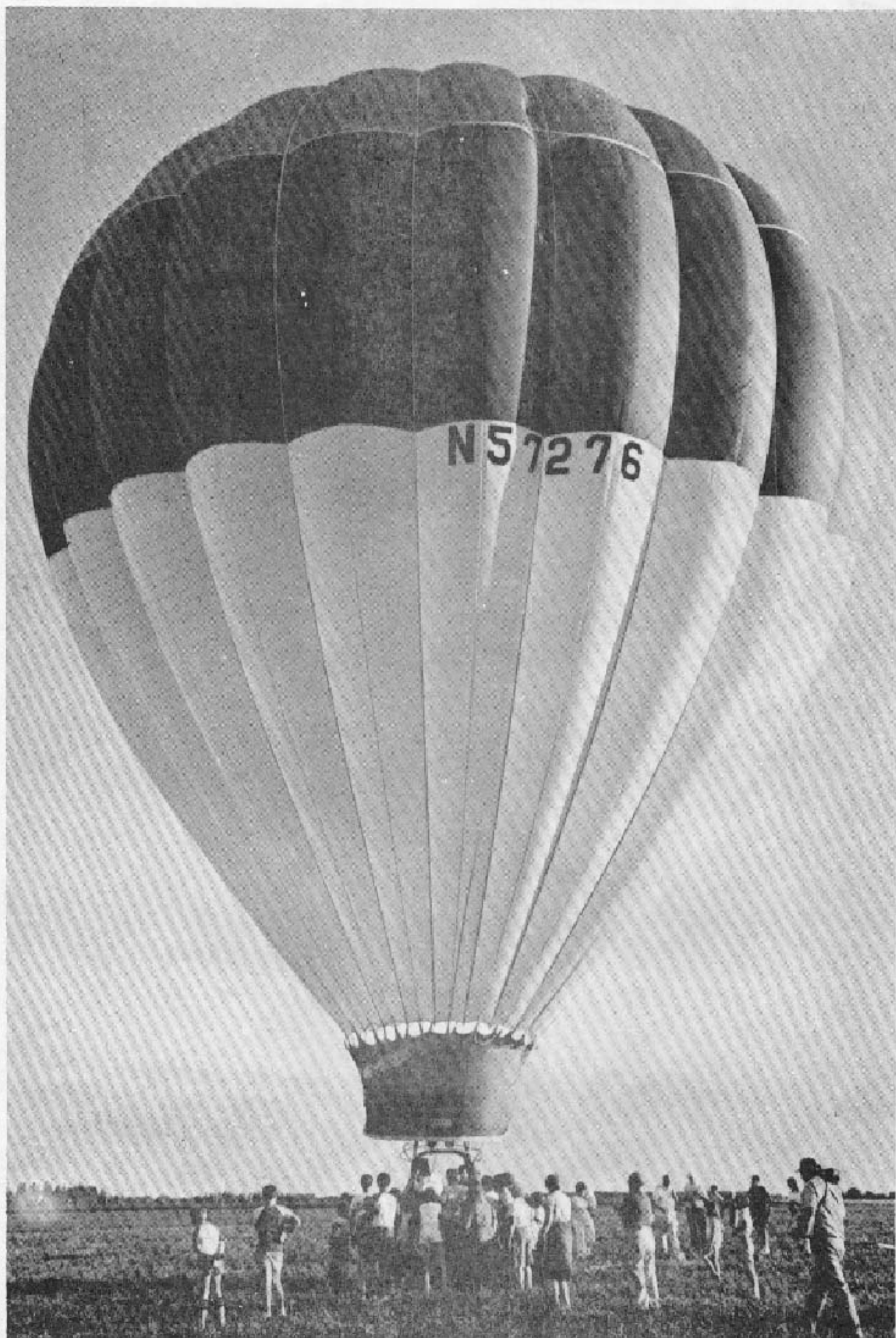
EVERYONE LOVES A BALLOON