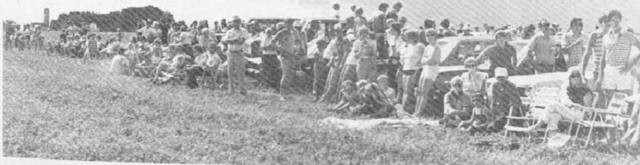
SOME OF THE CROWD VIEWING THE AIRSHOW