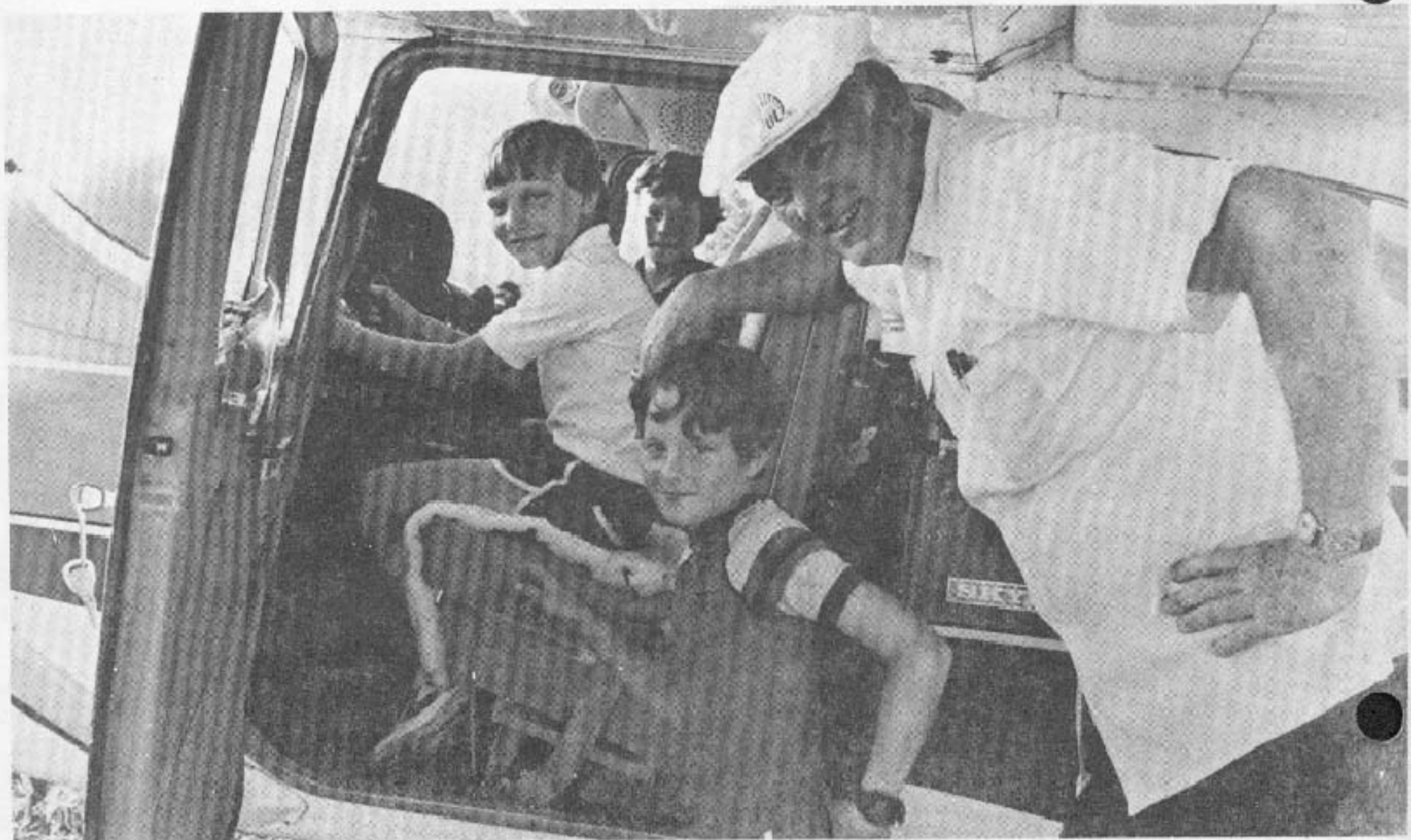
ARCHBISHOP HURLEY AND FUTURE NAPP ers