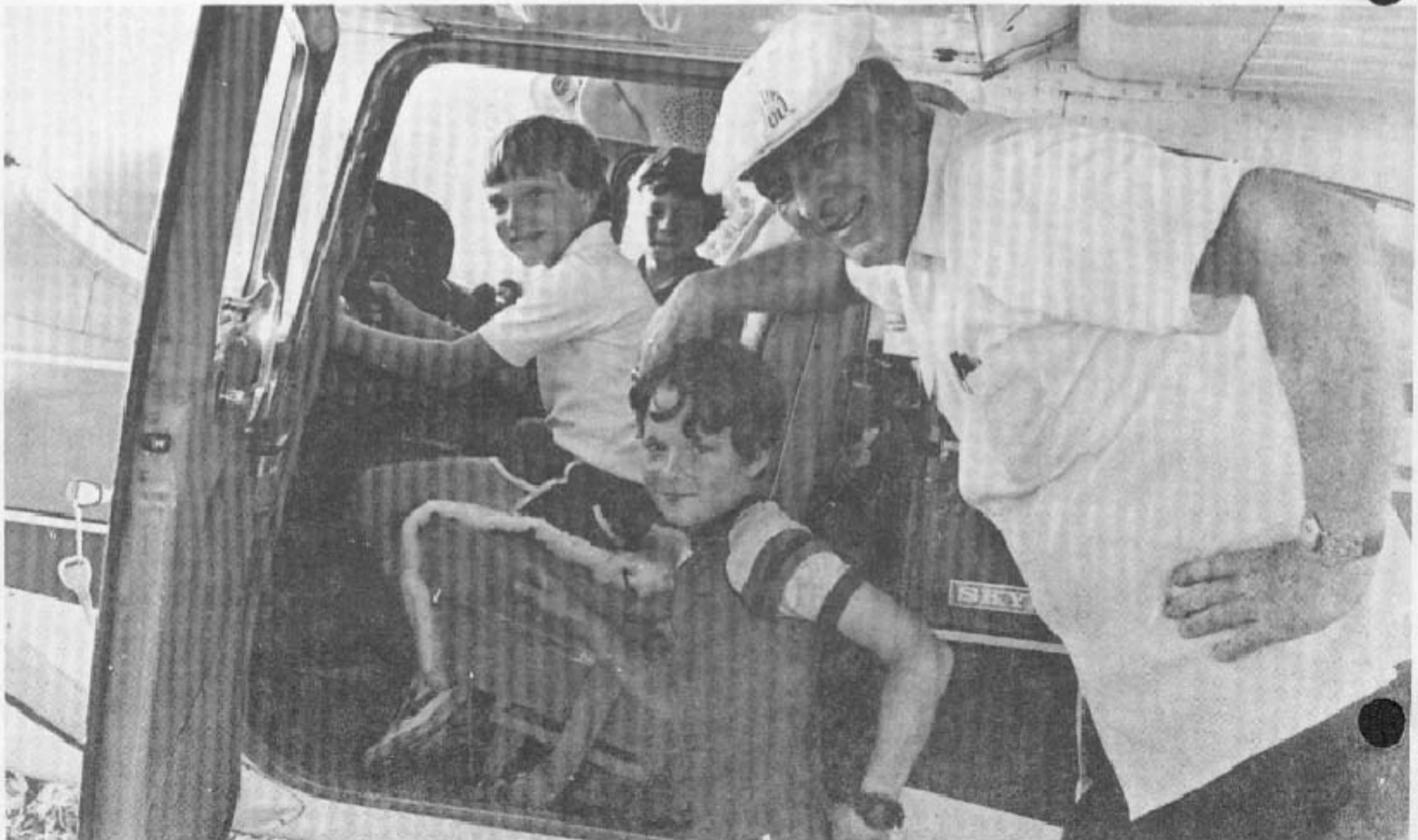
ARCHBISHOP HURLEY AND FUTURE NAPP'ERS