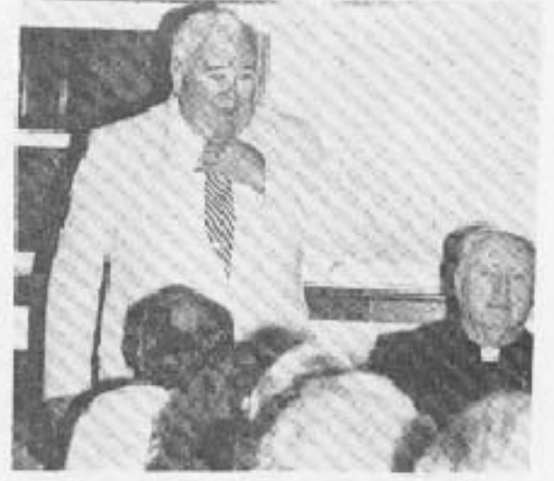
CHARLIE SWEENEY PILOT of B29 THAT DROPPED A-BOMB on NAGASAKI