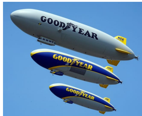
All three Goodyear blimps, led by Wingfoot One, fly in formation on June 3, 2025, in Akron, Ohio.

I'm looking forward to the next few months putting the final touches on our schedule. No matter how great our planned program will be, the best part is being together with one another. I hope there will be a great turnout!